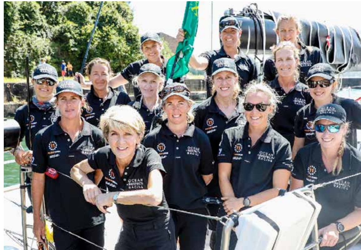
Ocean Respect Racing Crew and Ambassador Hon. Julie Bishop MP

The team competes to win while showing respect for the ocean with their actions and messaging. With the support of 11th Hour Racing, the team uses the platform of sailing to inspire positive action for the ocean amongst the Australian sailing community and the broader public – the team's campaign is centred around three key pillars: Act, Inspire, Engage.