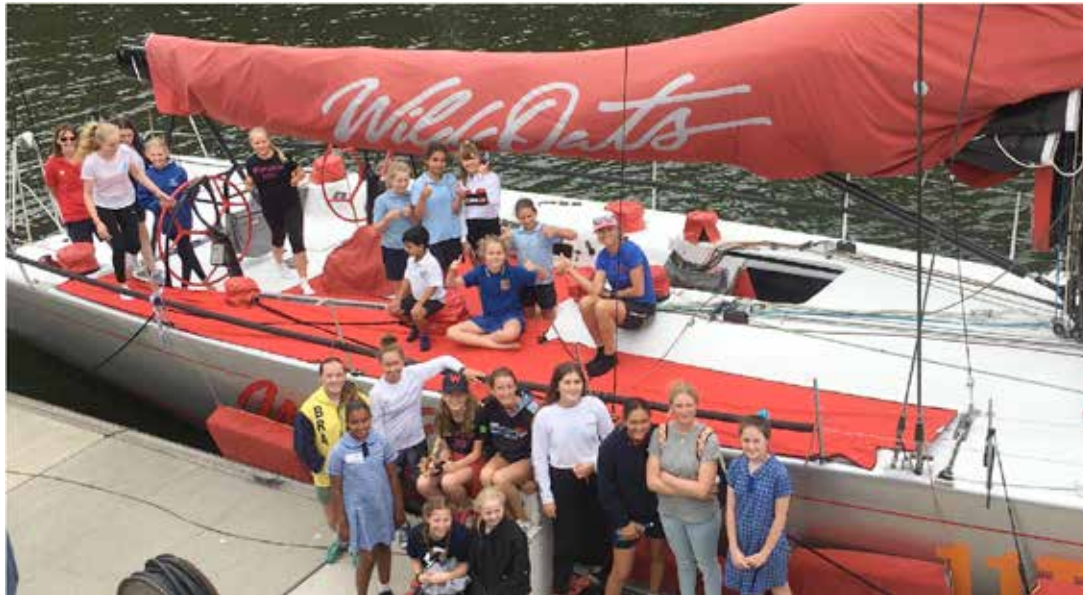
Hunters Hill female youth dinghy sailors visiting Wild Oats X

The Team invited the youth female sailors from Hunter Hill sailing club to come and meet some of the crew and visit the yacht. The young ladies learnt about the importance of looking after their harbour and oceans and how they can make a difference when sailing their dinghies. They met some of the world's finest female sailors and learnt about life onboard a racing yacht. More than 450 kids got the opportunity to visit the yacht, meet the sailors or hear about the team's race through school visits and boat tours.